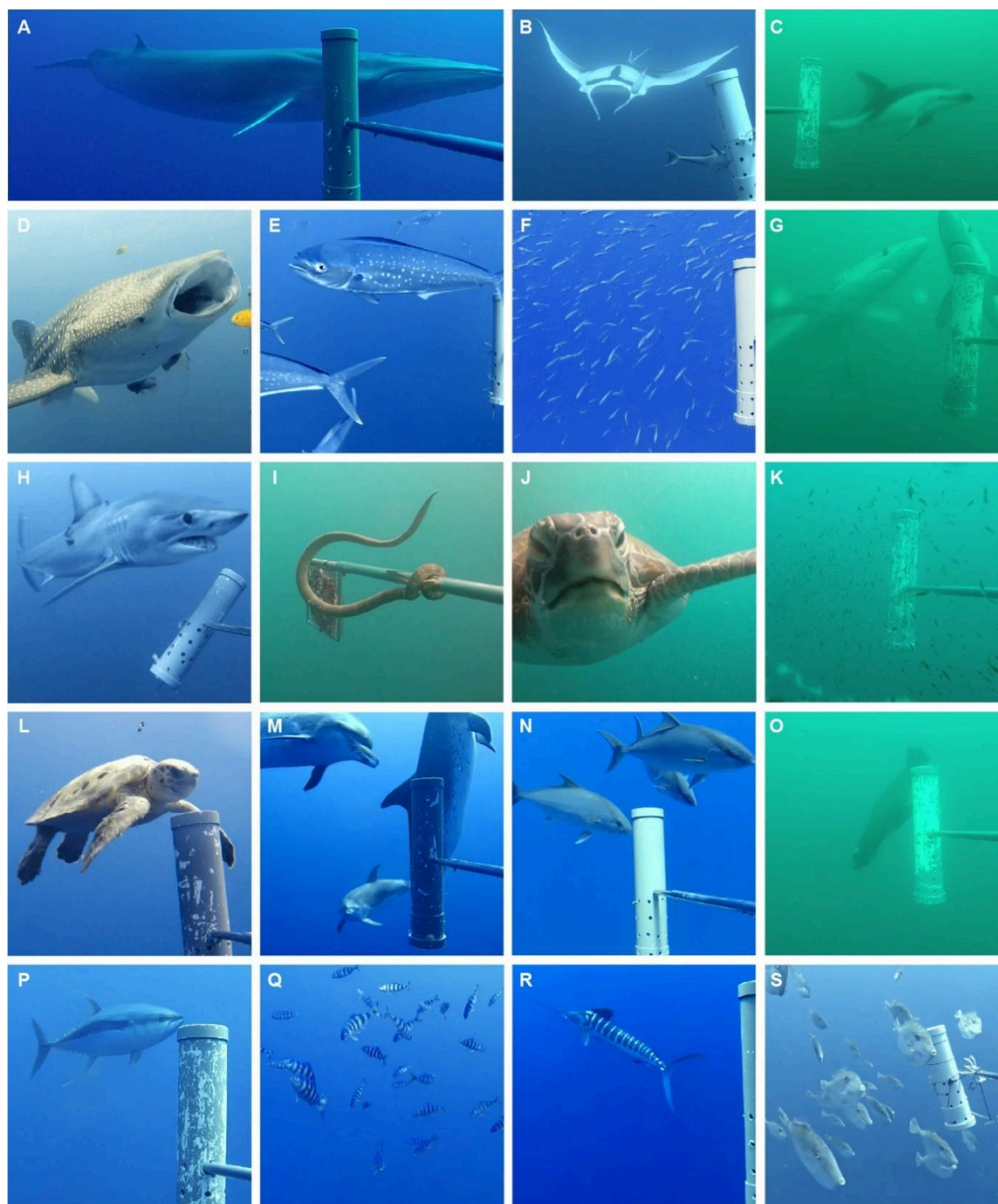
Figure 6.2: Example species observed on pelagic BRUVs. (A) Bryde's whale Balaenoptera brydei , (B) Manta ray Manta birostris , (C) Dusky dolphin Lagenorhynchus obscurus , (D) Whale shark Rhincodon typus , (E) Dolphin fish Coryphaena hippurus , (F) Atlantic horse mackerel Trachurus trachurus , (G) Blue shark Prionace glauca , (H) Shortfin mako shark Isurus oxyrinchus , (I) Sea snake Hydrophiidae sp., (J) Green turtle Chelonia mydas , (K) Krill Euphausia sp., (L) Loggerhead turtle

(2013b). Cameras can be either forward-facing (A, C) or downward-facing (B). The anchored design shown in C was adapted in Bouchet & Meeuwig (2015) to let BRUV units drift freely.